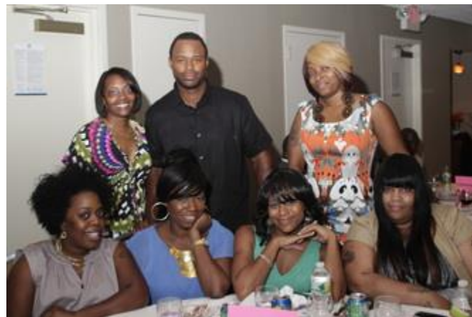
○ Some more of the guest at our 1 st scholarship awards gala