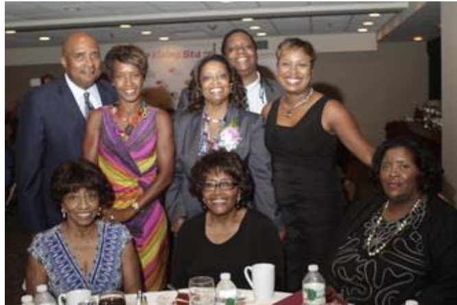
○ Some of the guest at our 1 st Awards Gala